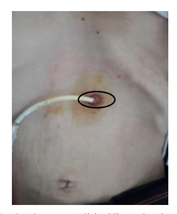
Fig. 1. Patient's gastrostomy site. Black oval: The patient's initial painful area.

Subsequently, the patient's dysphagia symptoms improved and the PEG tube was removed in May 2018. However, the patient continued to experience persistent abdominal wall pain near the