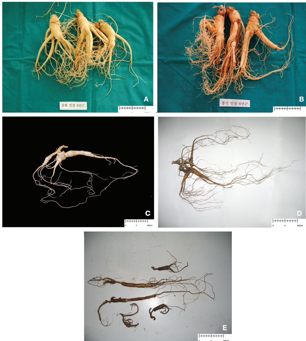
Figure 1 Ganghwa cultivated ginseng (A), Guemsan cultivated ginseng (B) and wild mountain ginsengs used for RNA isolation (C-E).

The CGs used in this experiment were 4 and 6 yr of age from various regions in Korea. The WGs used in this experiment was collected from Changbai mountain, in 2008. They were about 20-40 cm long, weighed about 20-30 g with the approximate ages of 30-50 yr (Fig. 1). The authenticity of the WGs were examined by a panel of the Korean medicine experts.