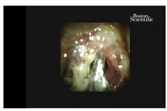
Figure 1 Exophytic tissue in the common bile duct visualised with SpyGlass cholangioscopy and biopsied with SpyBite forceps.

our findings and the clinical history of the patient, we requested additional staining for IgG4 cells, and resultant immunohistochemical stains demonstrated strong and diffusively positive IgG4 plasma cells along with obliterative phlebitis and storiform fibrosis (figure 2). Based on these results, the patient was diagnosed with autoimmune cholangiopathy secondary to AIP. He was started on prednisone and within days demonstrated gradual but clear clinical improvement.