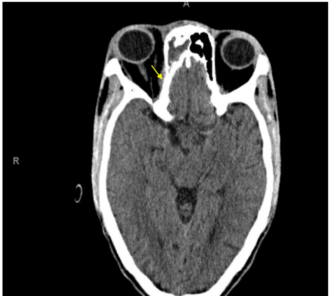
FIGURE 4: Opacification of the right ethmoid sinus on computed tomography of the head.

Yellow arrow points to mild subperiosteal inflammation, which could be the beginning stages of a subperiosteal abscess.