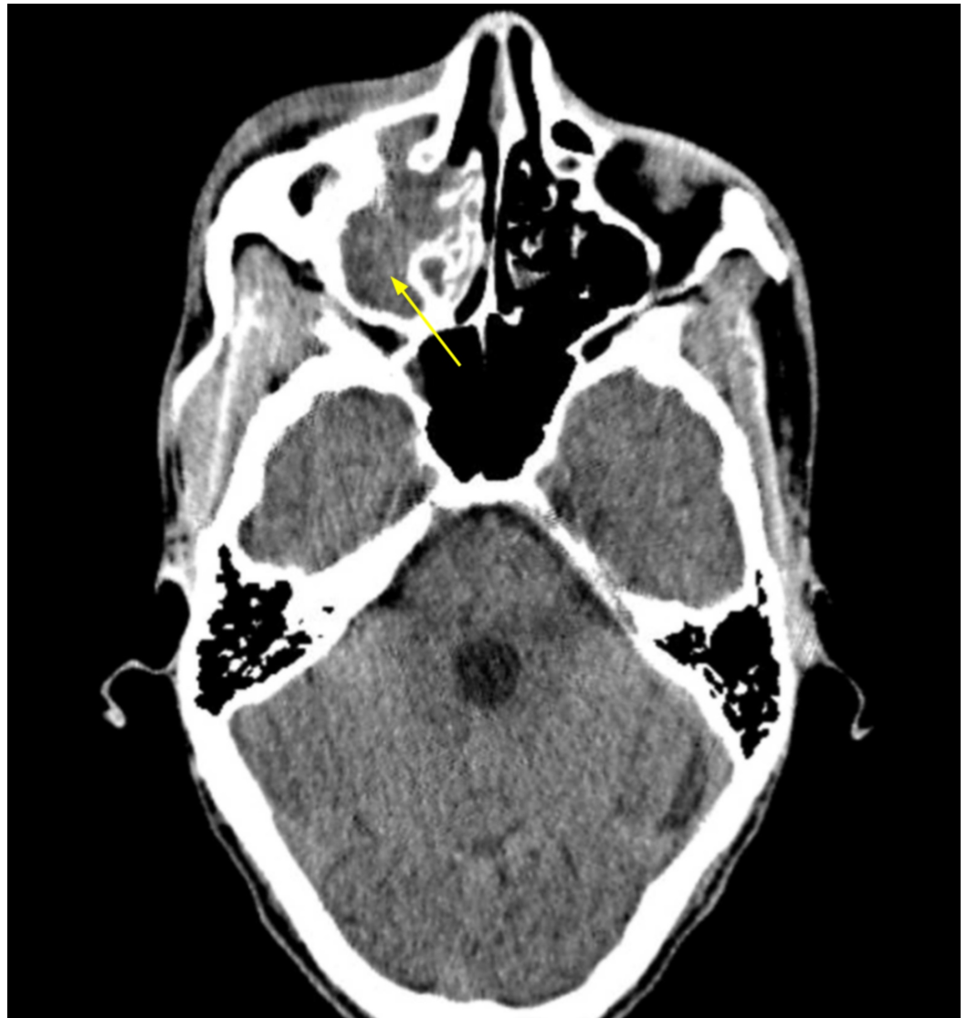
FIGURE 3: Opacification of the right maxillary sinus on computed tomography of the head.