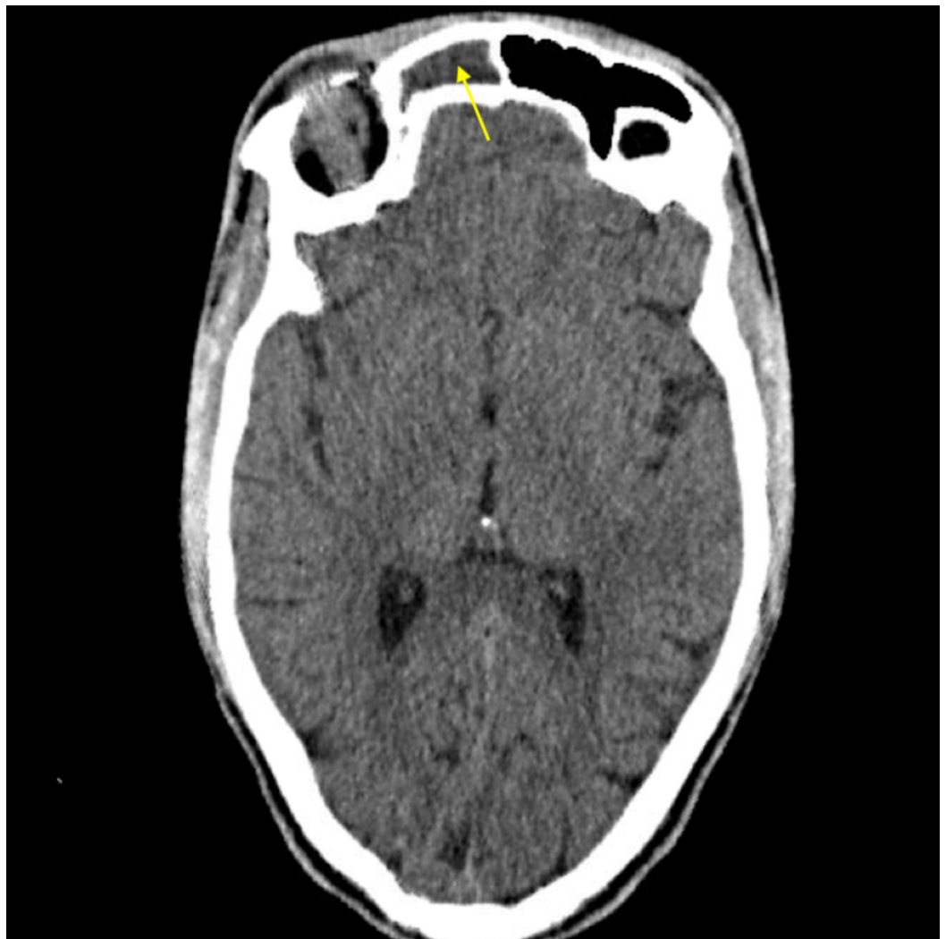
FIGURE 5: Opacification of the right frontal sinus on computed tomography of the head.