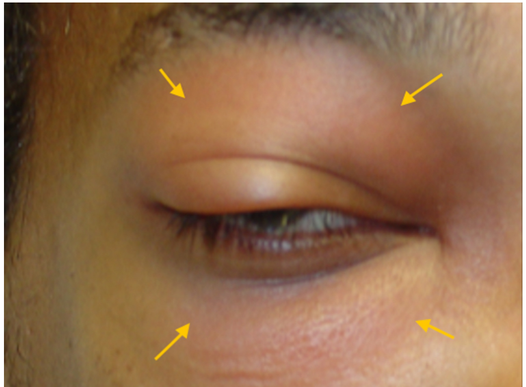
FIGURE 1: Clinical presentation of the patient. Note erythema, edema, and proptosis of the right eye (arrows).

On physical exam, his vital signs were stable and he was afebrile. The patient was sitting up in bed alert, awake, and oriented. He had significant right periorbital edema and erythema of the upper and lower eyelids with diffuse tenderness to palpation (Figure 1). Extraocular movements were intact, but he endorsed pain on medial and lateral gaze. He denied diplopia. Visual acuity in the right eye was 20/25 and 20/20 in the left eye. Pupils were equal, round and reactive to light. The nasal mucosa was erythematous but no nasal drainage was noted. An oral exam revealed multiple carious teeth with no associated fluctuant swelling or active draining fistulas, and his oropharynx was clear. The right maxillary canine was tender to percussion, but the tooth itself and adjacent teeth were vital and without gross decay. There was no cervical lymphadenopathy. His cranial nerve exam was within normal limits and the remainder of his physical exam was unremarkable.