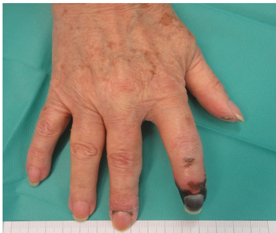
FIG. 1. Digital necrosis of the patient's right second finger, with necrotic lesions on the patient's right thumb and the middle finger's nail fold.

GPA typically manifests as renal and pulmonary involvement, with cutaneous manifestations occurring in up to 54% of cases. 1 However, the initial presentation of digital necrosis is a very unusual feature of GPA, with only a few cases reported. 2 Active vasculitis can cause destruction and thrombus formation within the affected vessels, resulting in digital ischemia and, in severe cases, digital necrosis. 3 Therefore, early detection and initiation of adequate treatment are critical.