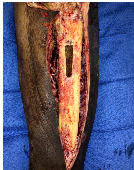
Fig. 4. Initial debridement of case 2 wound. There were widespread pitting and infection of the tibia that appeared non-salvageable. At this time, the knee joint appeared clear and preliminary plans for a stage below knee amputation were made pending cultures and pathology.