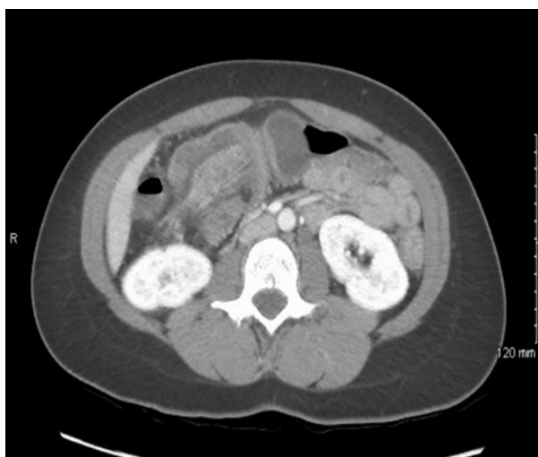
Fig. 1. Abdominal/pelvic CT showing colo-colonic intussusception at the hepatic flexure (yellow arrow).

cases [3]. Adenocarcinoma accounts for up to 30% of small bowel intussusception [3]. Oncologic resection remains the optimal therapeutic option for such cases. We report an atypical presentation of a 39-year-old female with intussusception due to an underlying ascending colon adenocarcinoma.