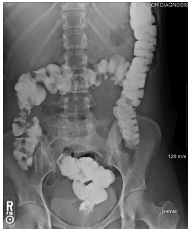
Fig. 2. Barium enema showing reduced intussusception with irregular narrowing of the ascending colon (yellow arrow).