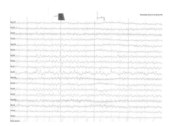
FIGURE 1: The patient's electroencephalogram had no abnormal findings.

This patient was initially presented as a typical case of conversion disorder; functional neurologic symptoms and secondary gain (i.e., disability pension and no responsibility resumption) were prominent in this case. The long-term course of patient's disorder was in line with literature reports, and he experienced high levels of disability. Prognosis of