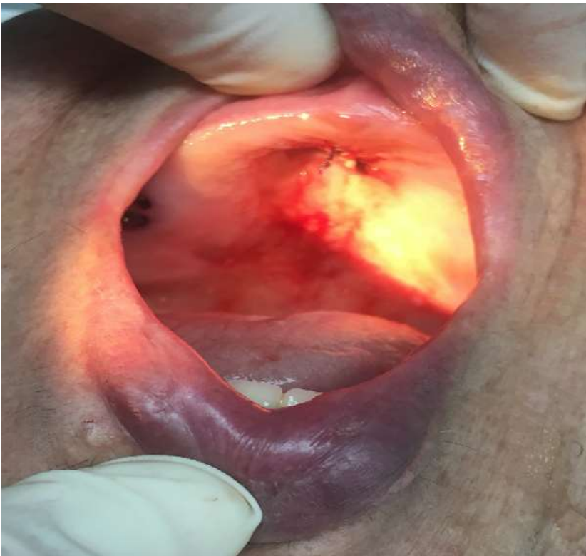
Figure 2: intraoral examination (after excision)