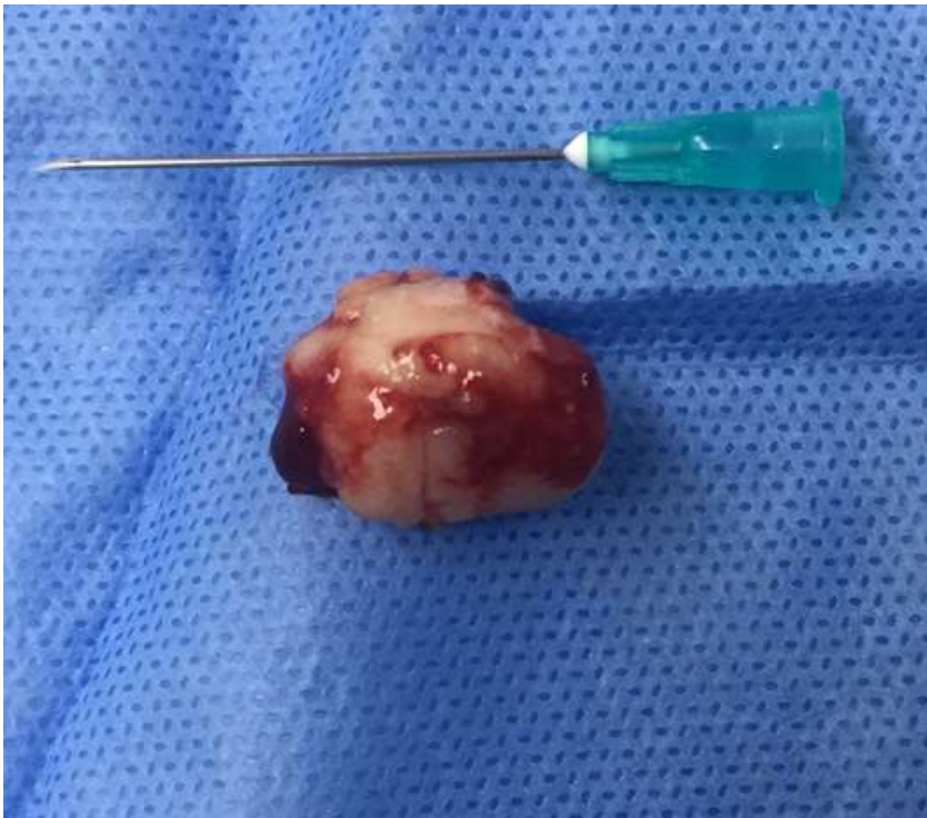
Figure 3: inferior aspect of the specimen