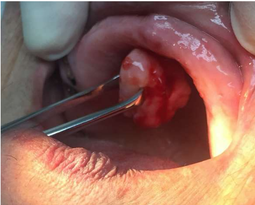
Figure 1: intraoral examination (before excision)