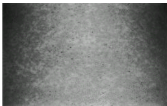
Fig. 2. In the close-up of back, the petechial lesions were also observed. They also seem to be due to the Epstein-Barr virus infection.