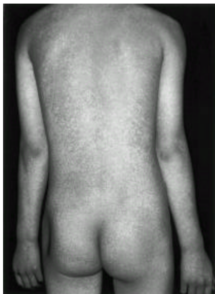
Fig. 1. The scarlatiniform skin rash in the 16-year-old boy with hemolytic uremic syndrome associated with Epstein-Barr virus infection. This rash appeared a few days before admission and subsided on the 3rd day after admission.

moderately developed and nourished. His vital signs were as follows: blood pressure, 180/110 mmHg; pulse rate, 80 beats per minute and regular; respirations, 20 per minute; temperature 37.2 °C. Jaundice was not present. He had a skin rash over his entire body (scarlatiniform and petechial) (Fig. 1, 2), periorbital edema, cervical lymphadenopathy and severe tenderness in the right costovertebral area.