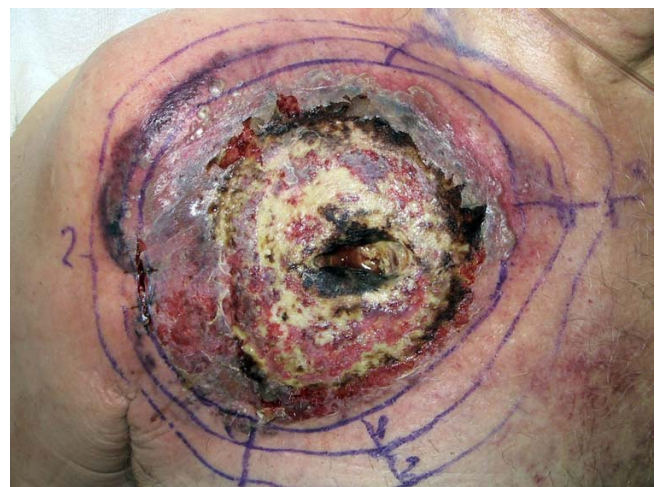
Figure 3 5 days post extraction, diagnostic of PG retained.

Despite these antibiotics, a fever and an inflammatory state persisted. The skin necrosis progressed rapidly around the TICVAD explanation site to the right upper chest wall (figure 3). A biopsy of the necrosis's edge revealed non-specific inflammation, diagnosis of PG is retained on clinical evolution. Corticosteroid therapy was started, improving both the skin lesions and systemic inflammatory signs.