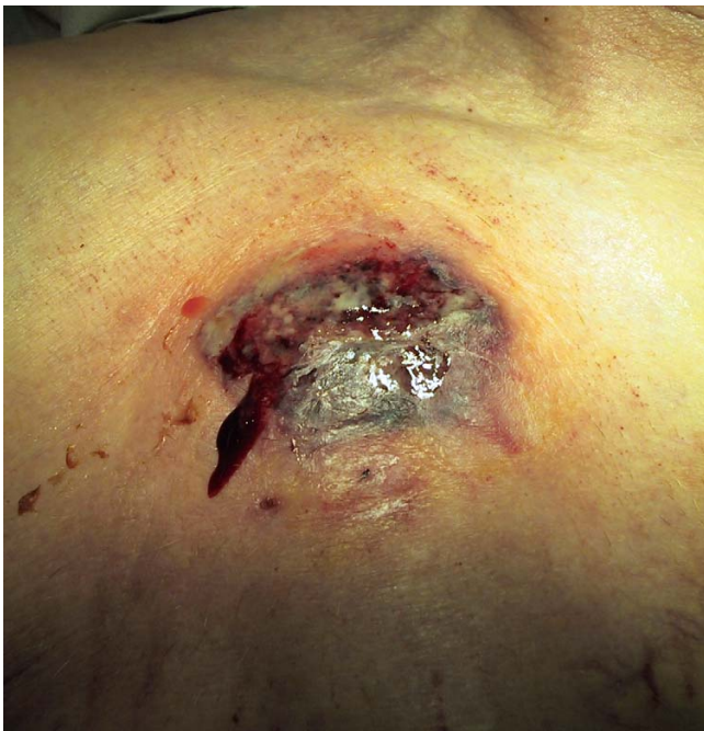
Figure 1 7 days after TICVAD implantation.

A 90 year-old patient in good general health, known for a myelodysplastic syndrome with refractory anaemia and myelofibrosis, became transfusion and thrombapheresis dependent, requiring implantation of a right subclavian TICVAD. Thereafter he developed dyspnoea and a fever of 38.6°C, motivating hospitalisation at the 7th postoperative day. An ischemic left cardiac decomposition was diagnosed, in the context of positive troponins, anterolateral ischemic signs on the ECG and severe anaemia (haemoglobin 68 g/l). Important skin inflammation with central necrotic ulceration and violet coloration of the edges was noted on the site of the TICVAD (figure 1 and 2). Laboratory investigations revealed an inflammatory state (leucocytosis at 11,8 G/l, non segmented neutrophils 8%, C-Reactive protein 175 mg/l). The TICVAD was removed on the 8th post-operative day, cultures were taken and wide-spectrum antibiotics (cefepime and vancomycine) were introduced. Because of persistent fever and progressive renal failure, the antibiotics were changed to imipenem