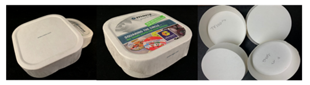
Figure 2. Examples of new paper-based packaging materials discussed in Stage 1.