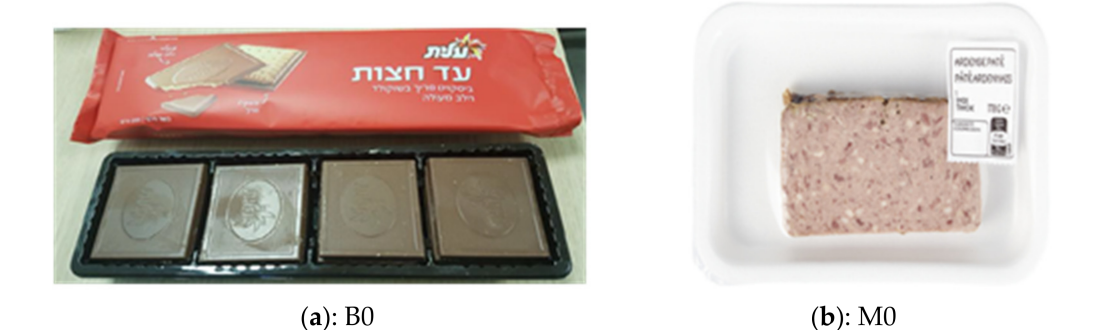
Figure 1. Examples of currently available packages discussed in Stage 1: ( a ) B0: Biscuit package; ( b ) M0: meat package.

Participants were then asked to discuss considerations when buying a product. Two currently available packages (one biscuit and one meat package: Figure 1) were presented to the participants. They were asked to open, manipulate, and discuss the advantages and disadvantages of the packages. Next, participants were presented with samples of the proposed sustainable paper-based packaging material (Figure 2) and asked to give their opinions on the characteristics of the materials. Finally, participants were asked for their willingness to buy or pay more for sustainable packaging.