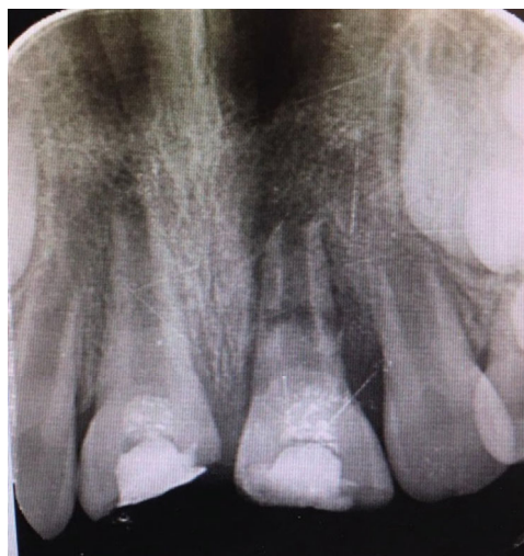
FIGURE 5: Follow-up after 8 weeks.