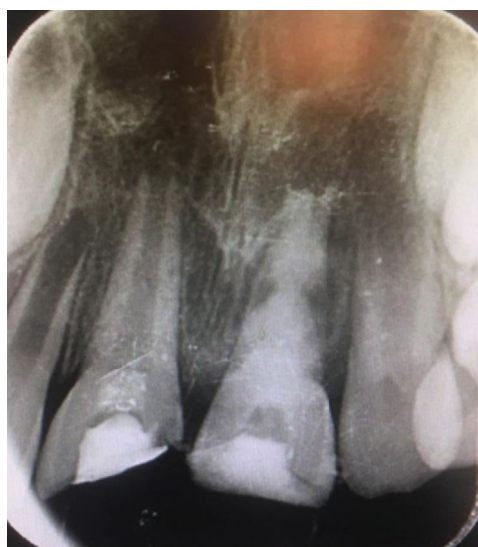
FIGURE 6: Calcium hydroxide was applied as intracanal medicament to stop the external resorption.

(Beyond Technology Corp., Beijing, China) and saline. The CaOH (Prevest Denpro, Golchai, Iran) was positioned within the canal and dressed with RMGI (Fuji II LC, GC, Tokyo, Japan) (Figure 6).