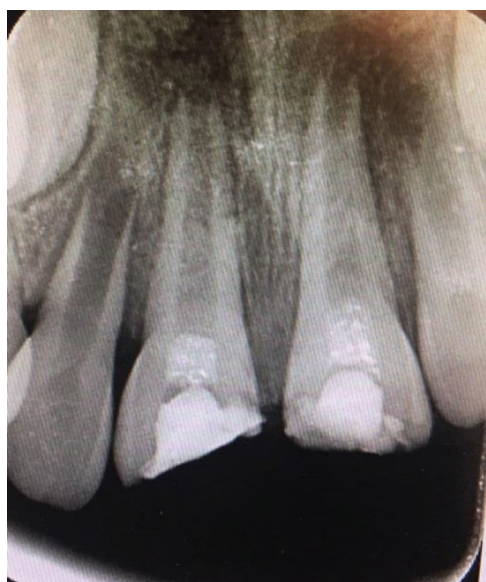
FIGURE 4: Follow-up after 4 weeks.