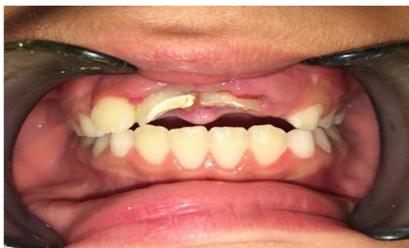
FIGURE 3: Cervical pulpotomy white MTA for both incisors.