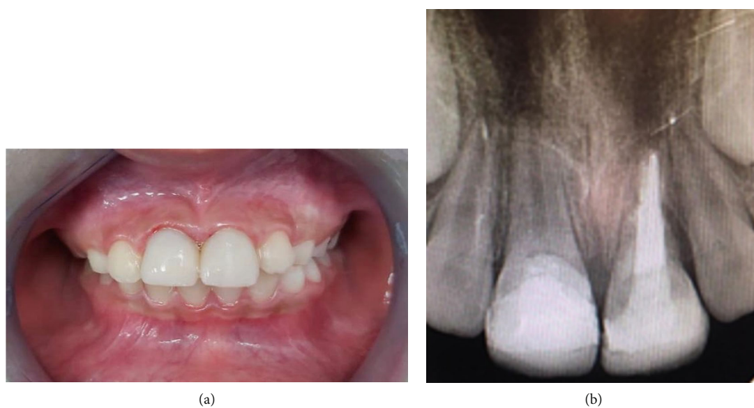
FIGURE 8: (a) Follow-up after 22 months. (b) Radiography after 22-month follow-up.