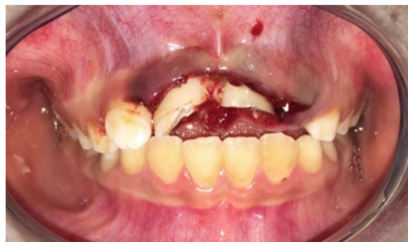
FIGURE 1: Intraoral examinations.

Cervical pulpotomy using white mineral trioxide aggregate (BioMTA, Seoul, Republic of Korea) was done for both incisors after under local anesthesia and rubber dam isolation; all coronal pulp tissues were gently removed by using a high-speed sterile round diamond bur (Dentsply Maillefer, Tulsa, OK, USA) under water cooling. Hemorrhage was controlled with sterile cotton pellets and sterile saline solution to avoid clot formation. When pulpal bleeding stopped within 3 min, MTA powder was mixed with distilled water according to the recommended consistency and placed without any pressure to cover the exposed pulps. A moist cotton pellet was placed on the MTA, and the cavity was sealed temporarily with RMGI (Fuji IX, GC Corporation, Tokyo, Japan) (Table 2 and Figure 3).