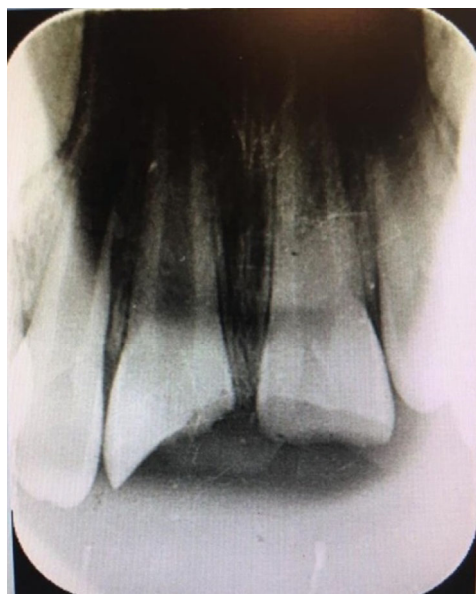
FIGURE 2: Radiographic examinations.

Follow-up after 4 weeks showed left central incisor percussion with spontaneous eruption, and the right central incisor percussion was metallic sound with no signs and symptoms. Radiographic evaluations have demonstrated a PDL widening in the middle third of the root in both central incisors (follow-up after 1 month) (Figure 4).