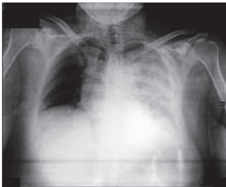
FIGURE 2: Chest X-ray (three hours postoperatively) demonstrating left pleural effusion.

respiratory rate, and oxygen saturation were in the normal range. Antibiotic treatment with piperacillin-tazobactam was administered empirically. C-reactive protein value was 196 mg/L (normal < 3 mg/L). Blood, urine, and sputum cultures were negative. On the fourth postoperative day, the patient developed epigastric pain radiating to the back, nausea, and vomiting. Serum amylase value was 313 U/l (normal: 28–100 U/l) and serum lipase value was 798 U/l (normal: 10–60 U/l). Serum levels of calcium, triglyceride, and liver transaminases were in the normal range. Serum bilirubin value was 1.73 mg/dl (normal: 0.2–1.2 mg/dl) and serum alkaline phosphatase value was 247 U/l (normal: 32–104 U/l). Abdominal ultrasonography and magnetic resonance (MR) cholangiopancreatography were normal. Chest and abdominal CT scan demonstrated minor left hydrothorax and postoperative alterations at the area of the left kidney. There were no pathologic findings from the abdominal viscera (Figure 3). These findings were consistent with the diagnosis of AP. According to the internal medicine consultation, the patient was treated with fluid resuscitation, pain control, complete