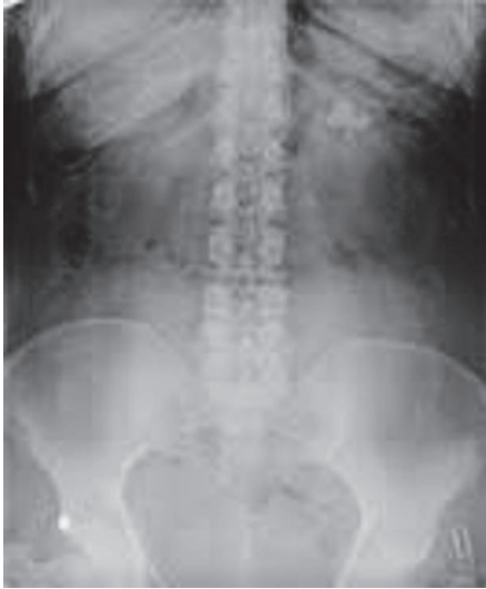
FIGURE 1: Preoperative plain X-ray of the kidney, ureter, and bladder region showing a partial staghorn left renal stone.