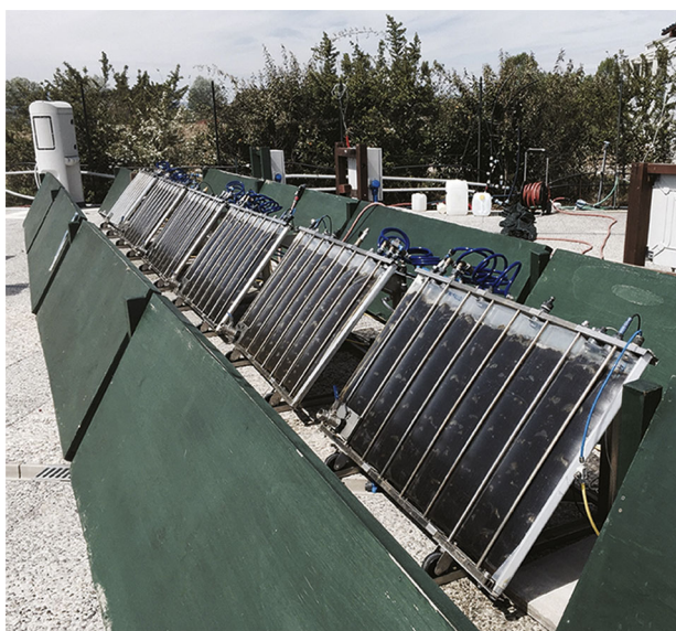
Figure 1. GWP ® -III reactors installed at the experimental area of Fotosintetica & Microbiologica S.r.l. (Sesto Fiorentino, Florence, Italy). Dummies are placed in front, back, and sides of the reactors to simulate a full-scale plant. The panels face south with an inclination of 50°. The distance between rows is 1 m.

The productivity of outdoor cultures was expressed as areal productivity (in g m -2 d -1 ), that is, productivity per unit of culture