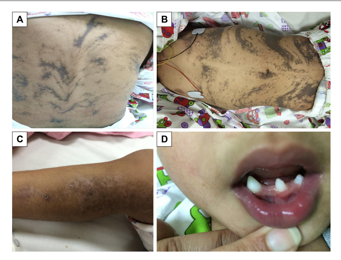
Figure 1 Patient's skin and teeth manifestations. Notes: (A, B) Hyperpigmented lesions on the back and abdomen; (C) stage 4 hypopigmented lesion on the lower limbs; (D) conoid and missing teeth.