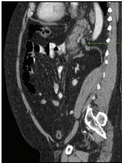
FIGURE 2: Sagittal plane; diaphragmatic crura impinging the pancreas.

and no helicobacter pylori identified. The patient refused any surgical intervention. He clinically improved and was discharged with outpatient follow-up.