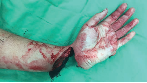
Fig. 1. Preoperative picture showing nearly total amputation at left radiocarpal joint.

[online], which provides a summary of the patient's preoperative condition, surgical process, and postoperative outcomes.)