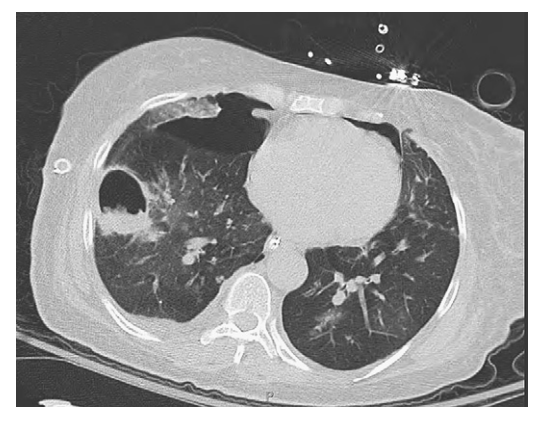
Fig. 2. A bilateral lung transplant recipient developed a thick-walled right lower lobe cavity, which was confirmed to be due to invasive aspergillosis histologically. The recipient developed respiratory failure and pneumothorax and did not respond to therapy.

The diagnosis of invasive Aspergillus infections is based on appropriate clinical signs and symptoms combined with pathologic and microbiological confirmation. The Aspergillus galactomannan antigen assay has been used as a marker of angioinvasive disease, especially in the stem cell recipient population, but the sensitivity of the assay for the diagnosis of invasive disease in lung transplant recipients has been reported to be only 30% and is especially poor in patients with