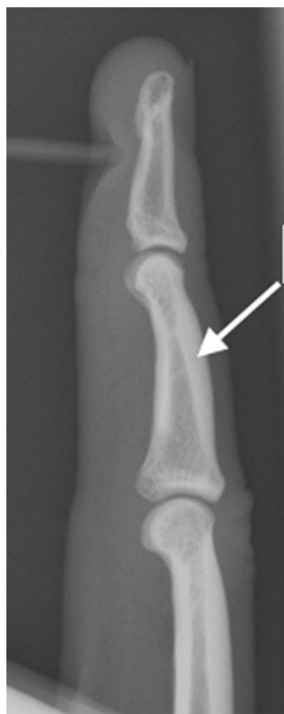
Figure 2. Cortical hypertrophy.

measurements were performed with a translucent scale using a magnifying glass; most (92%) of the re-evaluation radiographs could be analyzed digitally.