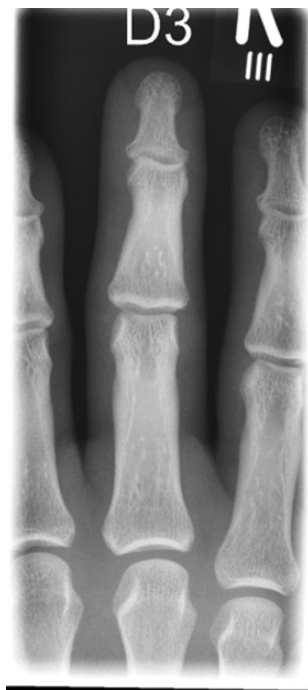
Figure 7. Normal radiographic findings of the same climber as in Figure 6 in 2011, still climbing at a national level.

RC group. This shows an increase of 2 climbers per group over the follow-up period.