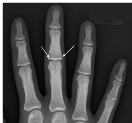
Figure 3. Subchondral sclerosis and broadened joint base.

measurements were performed with a translucent scale using a magnifying glass; most (92%) of the re-evaluation radiographs could be analyzed digitally.