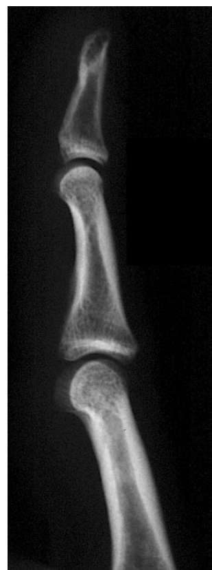
Figure 5. The same patient as in Figure 4, 11 years later.