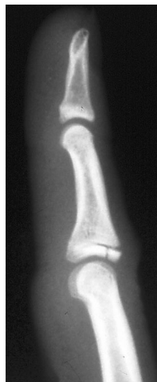
Figure 4. Epiphyseal fracture in 1999.

Signs of an early stage of osteoarthritis were seen in 6 climbers: 4 (27%) in the GJNT group and 2 (15%) in the