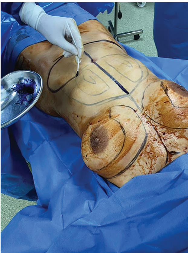
Fig. 2. A swab collection stick (instead of a marking pen) dipped in methylene blue stain is used to reinforce the markings intraoperatively.

The fat harvested for reinjection needs to be collected in sterile containers. The under-water seal (chest tube) represents an excellent alternative for fat collection, which is much cheaper than regular containers. The chest tube creates an isolated air-sealed suction, and the fat is