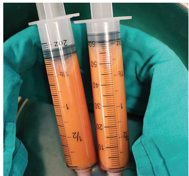
Fig. 3. Fat in a doughnut. The feeding syringes are kept upside down for fat to decant and are supported by a sterile wrap.

After fat decantation, the infranatant fluid is suctioned and the fat is prepared for injection. We prefer adding 2 ampoules of gentamicin to each liter of decanted pure fat.