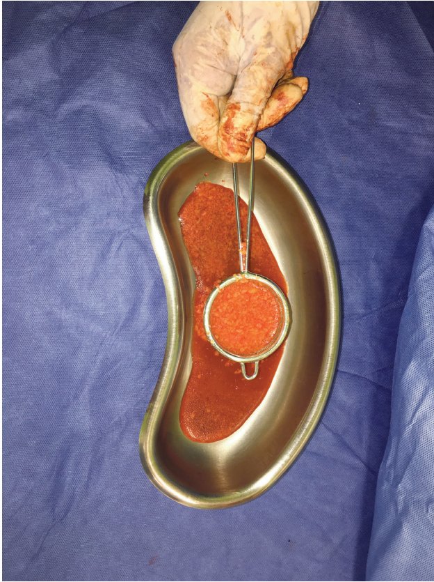
Fig. 4. Stainless steel nets are used for fat filtration. The net is cheap and can be autoclaved.

Using the feeding syringes and a sterile silicone lumen, the cannulas used for harvesting are used for injections.