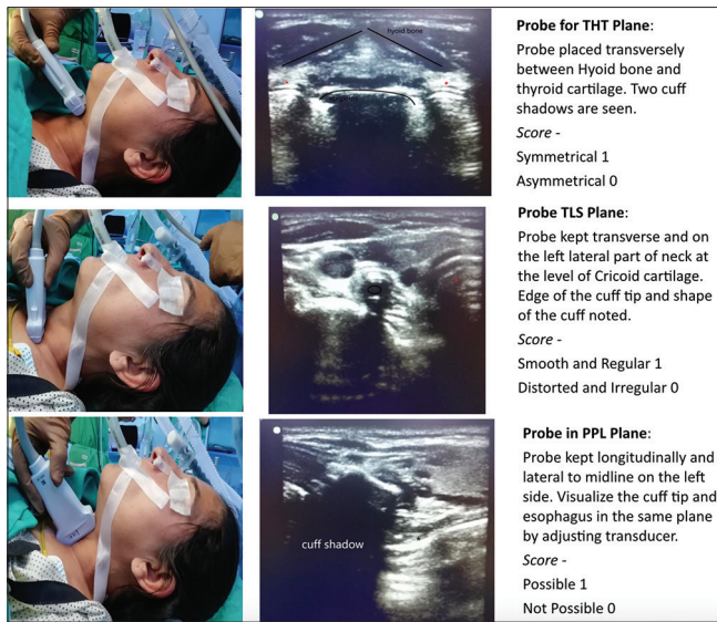
Figure 1: Figure showing the three planes in which ultrasound airway examination was done with the image viewed and the score allowed to different views