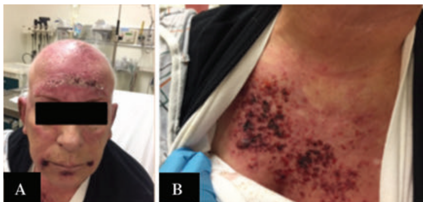
Figure 1. Images of the patient's skin rash and crusting lesions; A) periorbital edema and forehead skin breakdown; B) characteristic anterior chest wall (V sign) rash.

Dermatomyositis is a systemic inflammatory myopathy involving the skin, muscle, and connective tissue. DM is similar to polymyositis as they are both idiopathic inflammatory conditions; however, DM differs from polymyositis in that it exhibits