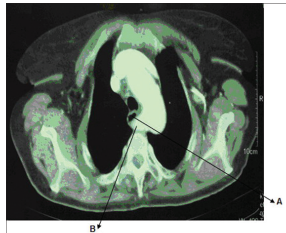
Figure 1: Computed tomography scan of aberrant right subclavian artery (B) posterior to esophagus (A)

However in patients who are candidate for upper mediastinal interventions such as esophagectomy (especially the transhiatal esophagectomy), even the asymptomatic cases of this arterial anomaly become challenging.