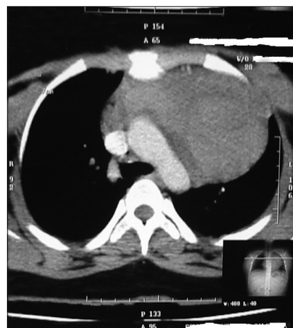
Figure 1: A 9.2 (CC) ×10.9 (trans) × 9.5 (AP) cm heterogeneously enhancing mass lesion in anterior-superior mediastinum

We did an extensive literature search on incidence of foot drop or severe neurological toxicity secondary to vinblastine in ABVD therapy and were surprised to note that no significant data existed. [1,2] The major toxicity reported with vinblastine was hematological and there were not even case reports on severe neurotoxicity. [1] Literature also did not support the omission of vinblastine in further