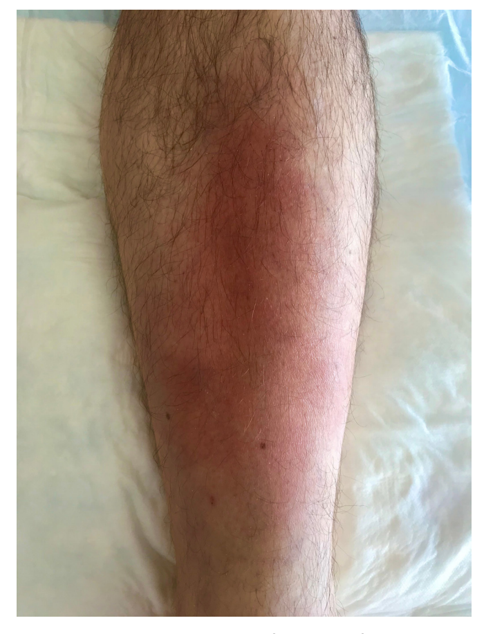
Figure 2 Erythema nodosum on the left leg at end of hospitalisation.

EN remains a self-limiting condition and usually resolves within a few weeks, although the exact aetiology frequently remains unidentified and untreated. General measures such as resting, raising the legs and compression stockings are usually suggested. In case of discomfort or extensive skin lesions, NSAIDs are the most commonly prescribed.<sup>9</sup> When patients fail to respond to non-steroidal anti-inflammatory drugs (NSAIDs), second-line therapy may be systemic glucocorticoids, provided