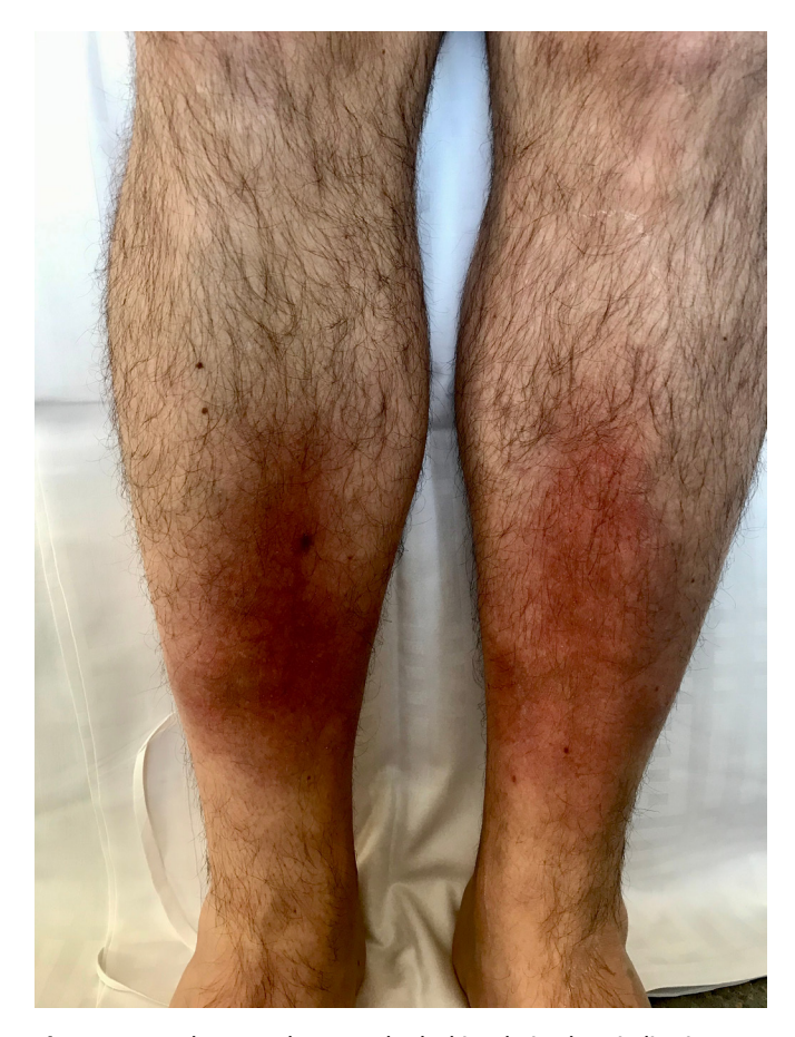
Figure 1 Erythema nodosum on both shins during hospitalisation.

In the currently available literature, there is little research on skin manifestations associated with COVID-19. Recalcati has postulated a cutaneous involvement similar to that found in common viral infections, in 20.4% of patients among their cohort of 88 patients. The described cutaneous manifestations included erythematous rash, widespread urticaria and chickenpox-like vesicles.<sup>5</sup> Two cases of transient unilateral livedo reticularis were also reported by Manalo et al as a manifestation of COVID-19 thought to be due to a microembolic event.<sup>6</sup> Progressing pruritic lesions on both heels that became erythematous plaques were also described in a 28-year-old healthy woman.<sup>7</sup> In another case report, petechiae was described in a Thai patient, which could be wrongly interpreted as dengue.<sup>8</sup>