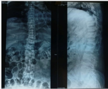
Figure 1: X-rays of the spine showed scalloping of the end plates.