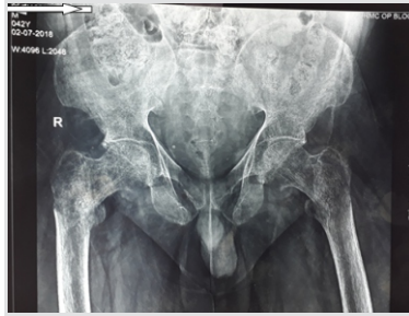
Figure 2: X-ray of the pelvis showed bilateral Looser's zone in the proximal femurs which are indicated by the arrows.