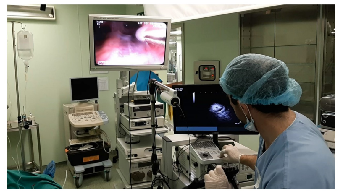
Figure 2. During a procedure.