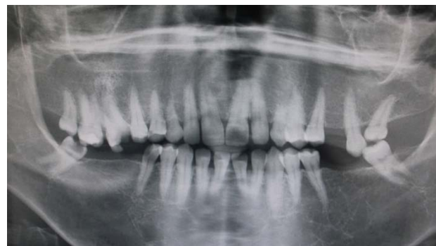
Figure 3. Panoramic view of the enlargement of marrow spaces with widened trabeculae.

Tooth transposition can be complete and incomplete based on the position of the roots and the crowns of transposed teeth. While the complete