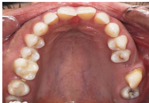
Figure 2. Occlusal view of the transposed maxillary canine.

Tooth transposition is a form of ectopic eruption, which can affect the maxillary or mandibular arch. This dental anomaly frequently involves the canine and first upper premolar. 1,5-6 The unilateral dental transpositions are more prevalent than the bilateral ones and mostly affect the left side. 1,5 No transposition has been reported in the deciduous dentition yet. 5,13