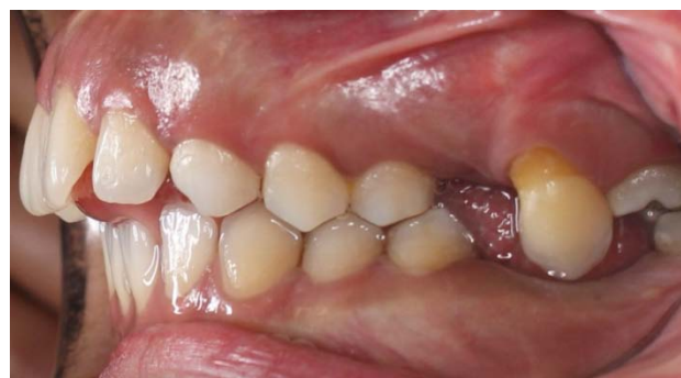
Figure 1. Intraoral view of the canine erupting mesial to the third molar.