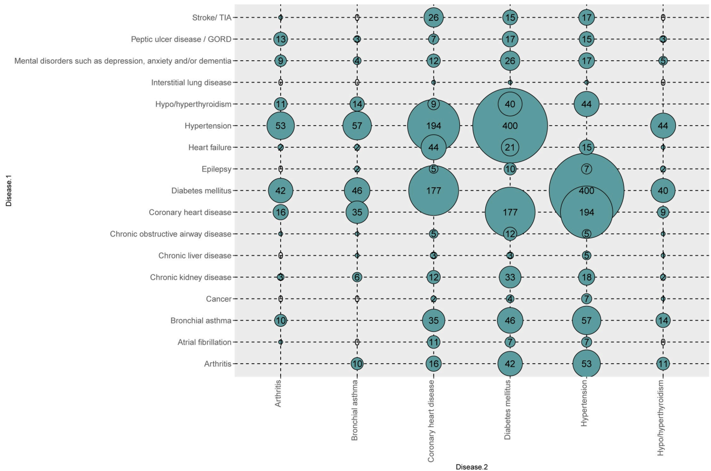
Fig 3. Non-communicable diseases in multimorbidity.

https://doi.org/10.1371/journal.pone.0243614.g003