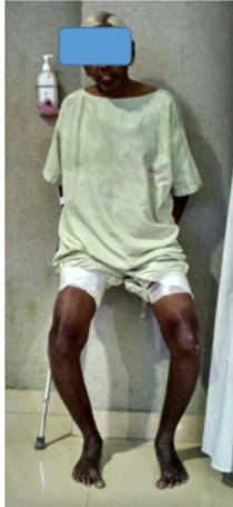
Figure 1: Clinical photograph of a patient with severe B/L knee deformity.