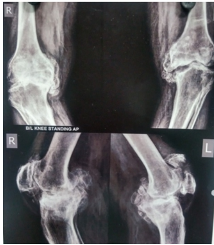
Figure 2: Radiograph of B/L knees.

Grade 4 osteoarthritic changes on the left side and arthritic changes on right knee also (Fig. 2). Other findings of blood investigations were normal. We decided to go for single-stage procedure with fixation of patella fracture and TKR. Anterior midline incision was taken, and medial parapatellar arthrotomy was done. On extensor side the retinaculum was found intact intraoperatively, so we first proceed with TKR. Calcified medial meniscus was excised, and posteromedial tibial defect was taken care with downsizing of the tibia. After thorough irrigation with normal saline and debridement of soft tissue from articular side of patella fracture, the fracture ends were approximated.