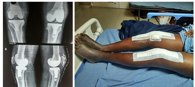
Figure 5: Immediate post-operative (POD) X-ray and clinical photograph POD day 1.