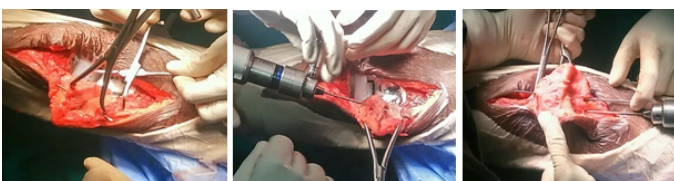
Figure 4: Intraoperative photographs.

suction drain. Post-operative radiographs showed an acceptable reduction of the fracture and an acceptable TKR. In post-operative period patient was allowed early knee mobilization up to 90°, and full weight bearing was allowed with the help of walking aid. At the end of 3 months patient achieved range of motion 5–110° and his knee society score improved to 90. The patella fracture united completely without any complication (Fig. 5).