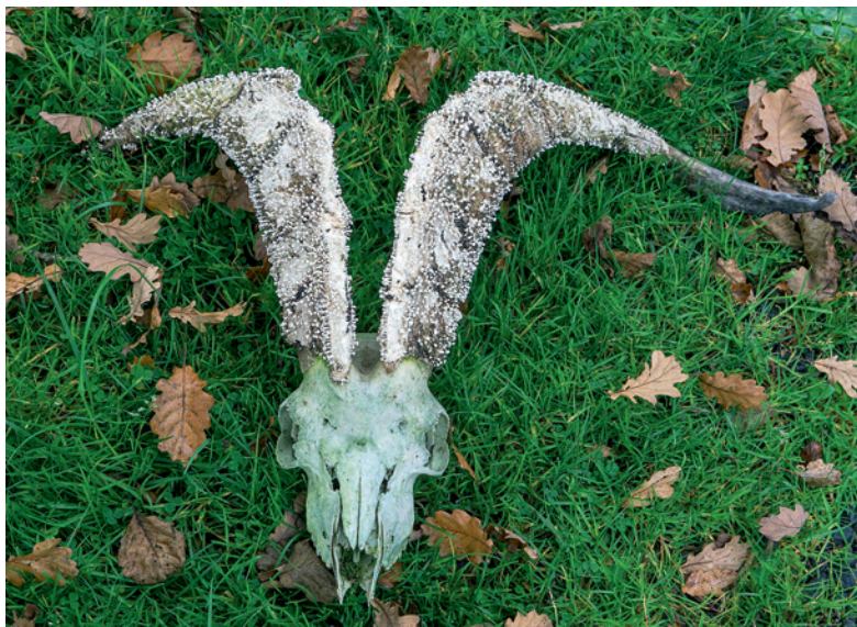
Fig. 5. Onygena species. Non-pathogenic species of Onygenales , are specialized in breaking down the keratin found in feather, hooves, and horn. The keratin is composed of proteins, bound in a non-bio-accessible form. Among the large number of different proteases produced by O. corvina , we discovered that just three enzymes, belonging to two types of protease families, are sufficient to breakdown both feather and pig bristles. The picture shows O. equina growing on horn, but not on the skull (Northern Ireland, 2012).

gained right now from chytrids and zygomycetes, notably Entomophthorales (Grell et al. 2011) and Mucorales (Huang et al. 2014).