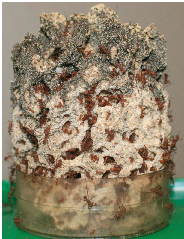
Fig. 2. Learning from Nature's "green biorefinery": Leaf cutter ants carry pieces of green leaves to the fungus garden ( upper ), feeding the fungal symbiont, Leucoagaricus gongylophorus , farmed in the fungal garden in the subterranean ant nest ( lower ; laboratory culture of Jacobus Boomsma). The fungus produces swollen tipped cells, filled with proteins and sugars, the gongylidia, organized in staphylae. The gongylidia are picked by the ants for feeding the ant colony with protein and sugar rich feed. Bottom line is that this successful and complex society, where fungal enzymes convert green leaves into accessible, highly nutritious fungal biomass provide basis for one of the most successful life forms on earth.

the molecular level due to the fungal enzymes and on the organismal level due to the fungal gongylidia (swollen hyphae filled with proteins and sugars), serving as highly nutritious food for the ants. The ants collect, distribute and chew (pretreat) the leafy biomass, and remove "garbage". It is the continuous supply of highly nutritious fungal gongylidia organized in bunches, the staphylae, readily harvestable by ants, which provides the basis for the ant colonies to grow to