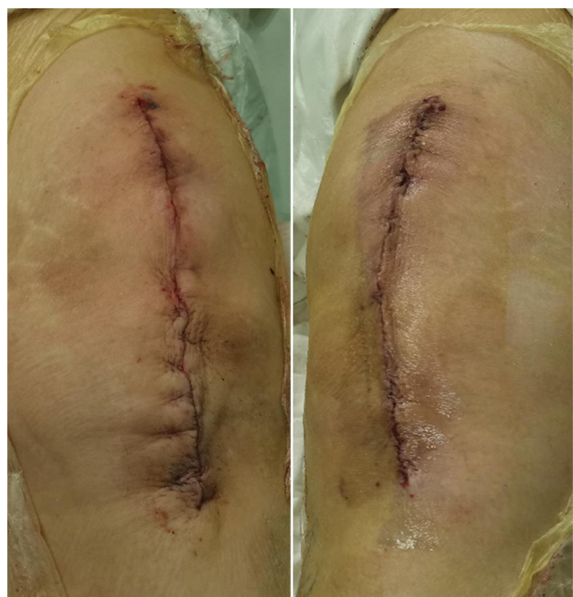
Figure 1 The appearances of bilateral incisions in the operating room (right: tissue adhesive group; left: control group).

index (BMI), postoperative length of stay (LOS), the times of dressing changes and the incision-related cost, were collected. Any delay in regular discharge (postoperative 4 days) due to incision was recorded.