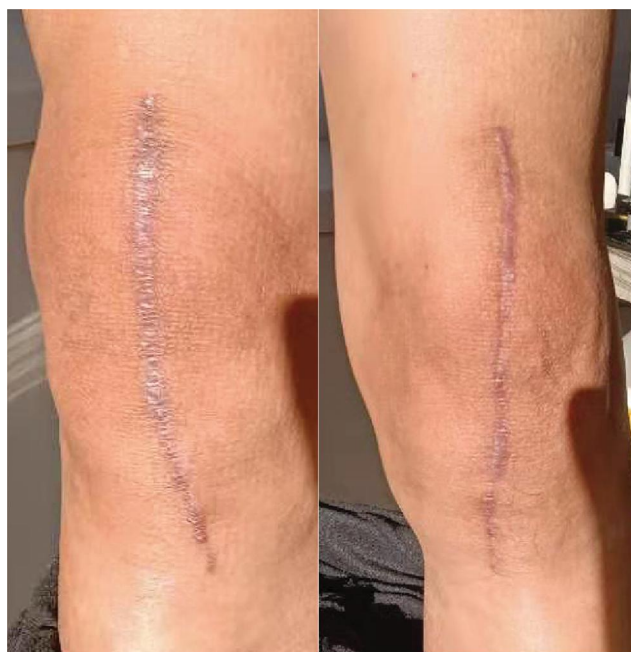
Figure 4 The appearances of bilateral incisions at postoperative two month (right: tissue adhesive group; left: control group).

This was the first study on comparing the clinical outcome, medical cost and patient preference of tissue adhesive plus subcuticular sutures with just subcuticular sutures in simultaneous bilateral TKA. The prospective and self-controlled clinical trial has eliminated the patients' personalized characteristics, such as BMI, individual healing abilities and systemic disease.