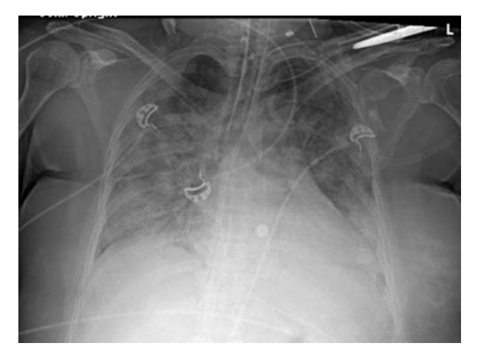
Fig. 3 Maternal chest radiograph for case B with diffuse bilateral lung opacification.

consistent with COVID-19 pneumonia and acute lung injury ( Fig. 3 ).