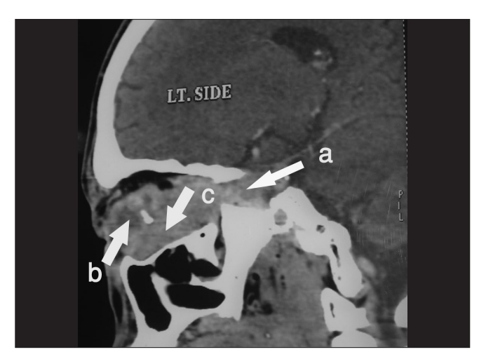
Figure 2: CT scan showing mass lesion in left orbit [arrows (a) retrobulbar extension of the tumor, (b) phthisis bulbi, and (c) tumor mass]

of onset, in early infancy (50%) and in early adolescence, suggested hormonal influence. [3] Even though nevus of Ota is common in the Orientals, malignant transformation is extremely rare. [4] It is still rarer to come across a malignant melanoma which is presenting as a nonchoroidal intraorbital mass. [5] This case presented as proptosis LE, and histopathological analysis showed malignant melanoma.