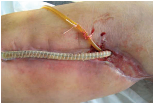
Figure 1. Completely exteriorized vascular prosthesis at the thigh level of a femoro-popliteal PTFE bypass.