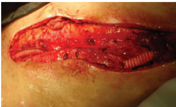
Figure 3. Covering the prosthesis with a muscle flap.

shows a purulent process around the vein, associated with a periphlebitis (Fig. 4). In this case, we decided to ligate the common femoral artery and explant the venous graft completely. Due to a good arterial compensation of the limb, we were able to perform a secondary limb revascularization. After the wounds healed, we restored vascularization with a new venous graft, this time covered with a Sartorius muscle flap, in order to prevent a new infection; the outcome was very good.