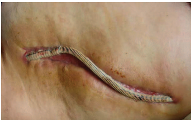
Figure 2. Exteriorized segment of axillo-femoral bypass.