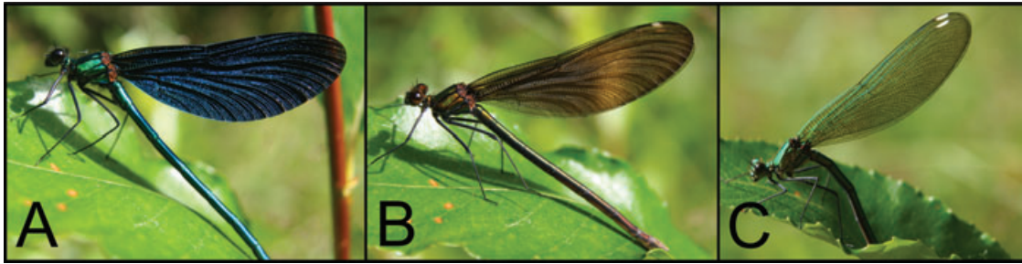
Figure 1. The study species. (A) Calopteryx virgo male and (B) female, and (C) C. splendens female. Note that the scale of the photographs differs.

C. virgo males, 22% of the males court them, suggesting that C. virgo males have relatively poor species discrimination (Tynkkynen et al. 2008).