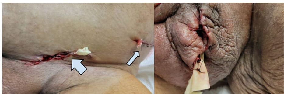
FIGURE 2: Intraoperative images

The patient was emergently brought to the operating room (OR) for surgical exploration and debridement of the left retroperitoneum, left groin, and scrotum. The left retroperitoneal space was accessed via a flank incision, where there was a significant amount of purulent fluid which was collected for culture. Blunt dissection of the left retroperitoneal space along the psoas muscle up to the lower pole of the kidney was performed. An organized hematoma was discovered in the left retroperitoneum which was removed. Additional incisions were made in the left inguinal region and the left scrotum (Figure 2).