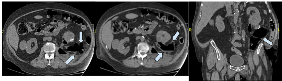
FIGURE 1: CT cross sectional images

A 61-year-old male with a history of end-stage kidney disease, diabetes mellitus, gross hematuria, status post ureteroscopy and ureteral stent placement seven months ago complicated by perinephric hematoma, presented to the emergency department (ED) with left-sided scrotal pain and swelling radiating to the left groin and back. The patient reported symptom onset 12 hours prior to presentation. The physical evaluation demonstrated crepitus of the left scrotum and left flank pain on palpation. On arrival, the patient's hemoglobin was 9.1 grams per deciliter (g/dL), serum creatinine of 3.2 milligrams (mg)/deciliter (dL), white blood cell (WBC) count of 8.7 \times 10^3 per uL (microliter) and a blood lactate of 3.1 mg/dL. His medication history included alprazolam, amiodarone, methoxy peg-epoetin beta, and nebivolol. The patient was started on piperacillin-tazobactam, vancomycin, and clindamycin in the ED. Computed tomography (CT) without contrast revealed complex abscesses within the left retroperitoneal space adjacent to the inferior aspect of the left kidney with extensive air along the soft tissue planes tracking to the perineum. In addition, a 10.0 x 5.0 centimeter (cm) hyperdense collection with air involving the left iliopsoas muscle was seen (Figure 1).