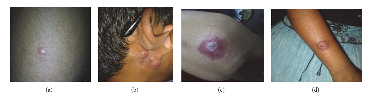
FIGURE 4: Different stages of a skin lesion in leishmaniasis, (a) early papular lesions, (b) multiple enlarging nodules, (c) an ulcerating nodule, and (d) a chronic ulcer.