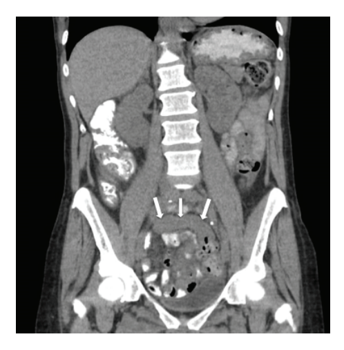
FIGURE 2: Rectosigmoid colonic wall thickening again demonstrated with white arrows at the site of stricture.

Two months after ED presentation, she returned to the ED complaining of nausea, vomiting, and abdominal pain. She had diffuse tenderness and voluntary guarding, but no rebound tenderness. No palpable masses were appreciated. Abdominopelvic CT showed diffuse colonic wall thickening and lymphadenopathy (Figures 1 and 2).