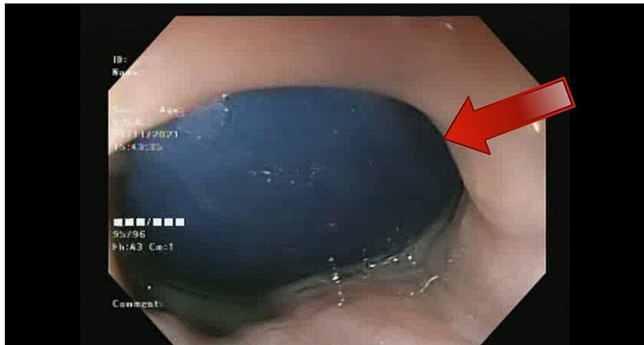
FIGURE 1: Weight reduction balloon stuck in the proximal portion of the stomach in post gastric sleeve patient.