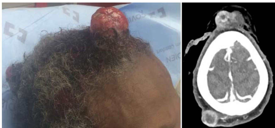
Figure 2. Gross and computed tomography scan presentations of scalp metastases.