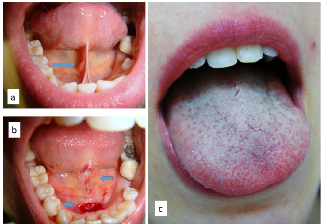
FIGURE 2: Thin and very short frenulum in a young girl (a), surgically cut by diode laser anterior and posterior (arrows) to the caruncula sublingualis (b); lingual movement improvement after treatment (c).