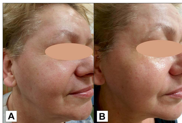
Figure 2 A 61-year-old female patient with diabetes mellitus type 2: (A) at baseline; (B) after a series of radiofrequency treatments.