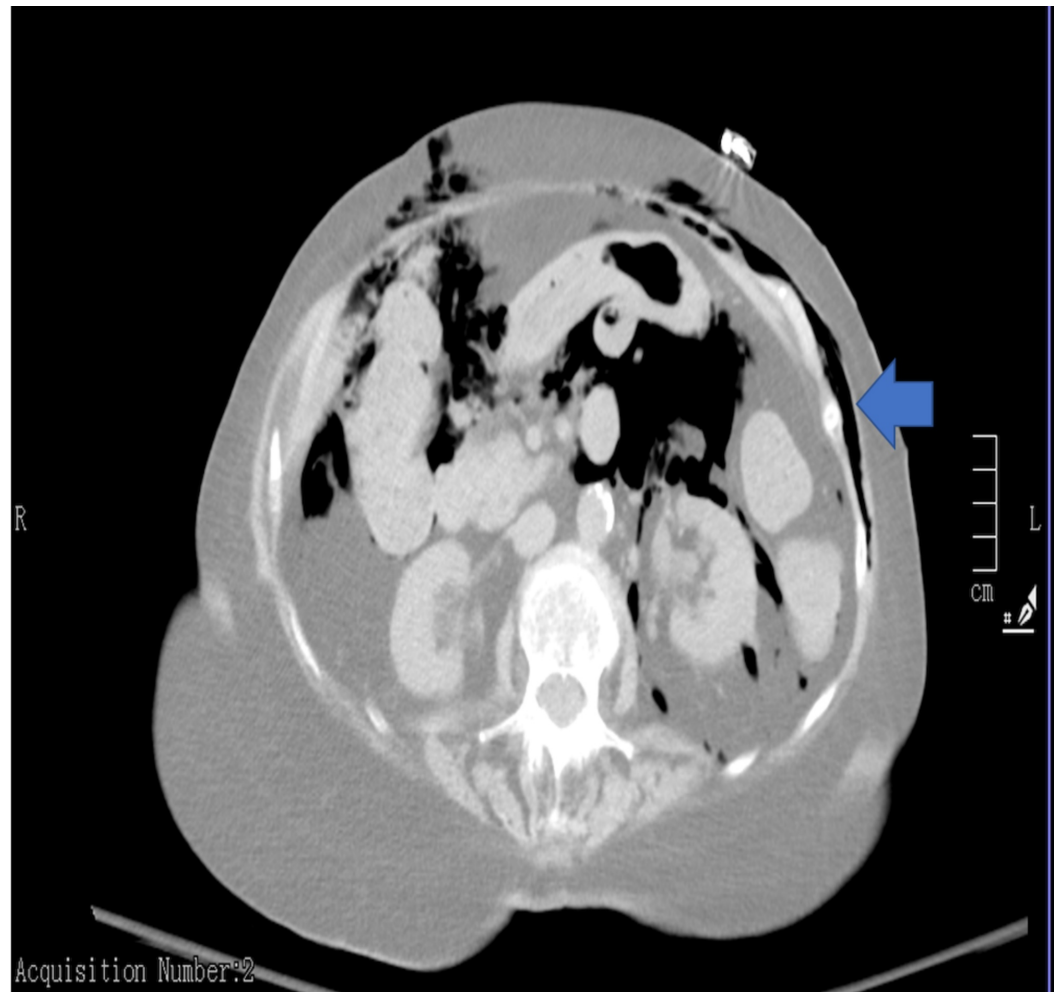
FIGURE 3: Air in the abdominal cavity, retroperitoneum, and subcutaneous tissue (solid arrow)