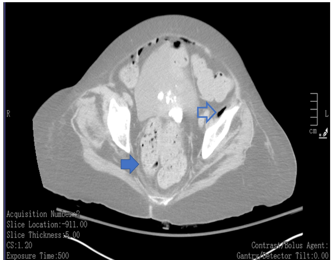
FIGURE 1: Fecaloma in rectum (solid arrow). Pneumoperitoneum with air in the pelvis (outlined arrow)

A non-contrast CT of the abdomen and pelvis performed in the emergency room revealed a fecaloma with pneumatosis in the mediastinum, abdomen, and subcutaneous tissue over the chest and abdomen (Figure 1, Figure 2, Figure 3). The patient was taken emergently for an exploratory laparotomy, which revealed no obvious pathology in the intraperitoneal cavity. The peritoneal reflection over the rectum and pelvic wall was opened to expose both the pelvic rectum and a cavity with fecal spillage dissecting up into the retroperitoneum. A Hartmann's procedure with end-sigmoid colostomy was performed after thorough irrigation with sterile saline and drain placement. Pathology report of gross specimen described necrotic and inflamed tissue with perforation and no malignancy. The patient's postoperative course was complicated with prolonged intubation and acute kidney injury, where she eventually succumbed to multiorgan failure.