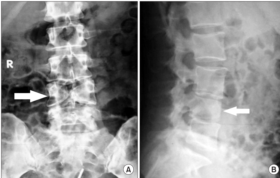
Fig. 1. X-ray of the lumbar spine. (A) Anteroposterior view showing L4 butterfly vertebra (arrow). (B) Lateral X-ray of the lumbar spine, demonstrating anterior wedging of the L4 vertebra (arrow), which can be confused with a compression fracture.