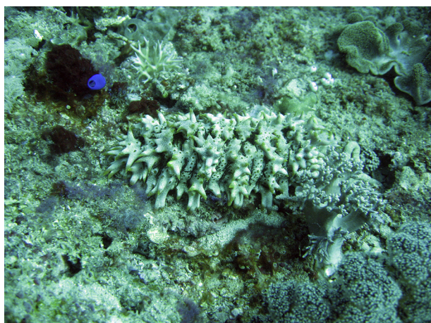
Fig. 2. Thelonata ananas from Kupang, Indonesia.

T. ananas and T. anax are two sea cucumber species belong to the Stichopodidae family which found in tropical waters. T. ananas (Fig. 2) are known as pineapple sea cucumber or prickly redfish. These species is considered as commercial sea cucumber species and one of the most popular edible sea cucumber species consumed in China and Southeast Asian countries. 16 Due to intense commercially exploitation population, these sea cucumber species declined by 80–90% in at least 50% of its range and listed as endangered species by the International Union for Conservation of Nature . Medicinal value of T. ananas including antioxidant, anti-inflammatory, antitumor, antiproliferative, anticoagulant and antiviral effects have been established.