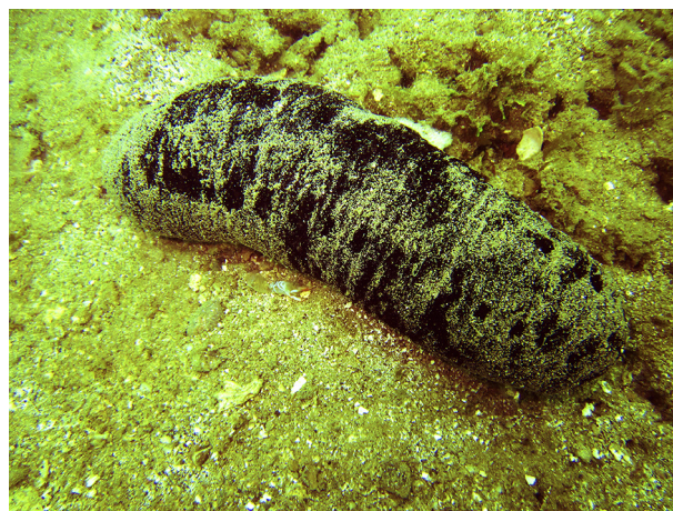
Fig. 6. Holothuria atra from Lembeh strait, Indonesia.

H. atra (Fig. 6) is commonly referred as black sea cucumber or lollyfish. Recently, their importance as a source of novel bioactive