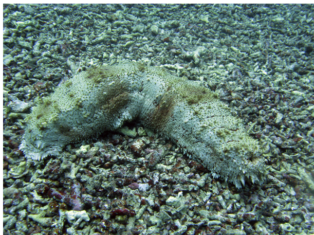
Fig. 4. Thelenota anax from Halmahera, Indonesia.

The popular name for H. fuscogilva (Fig. 5) is white teatfish. 5 H. fuscogilva is one of the most prized of the commercially sea cucumber species in the world. 28 These species distributed throughout the Indo-Pacific and has a patchy distribution on reef