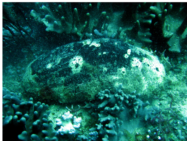
Fig. 5. Holothuria fuscogilva from Kupang, Indonesia.