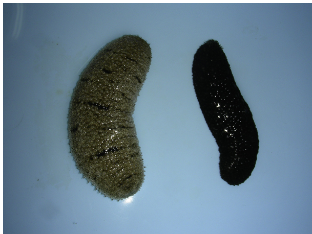
Fig. 8. Holothuria scabra .

antibacterial activity was demonstrated. 54 The expression of defensive lectin is induced by bacterial challenge, wherein cell wall glycoconjugates of bacteria are involved in lectin induction. Further, lectin also showed strong broad spectrum antibacterial activity.