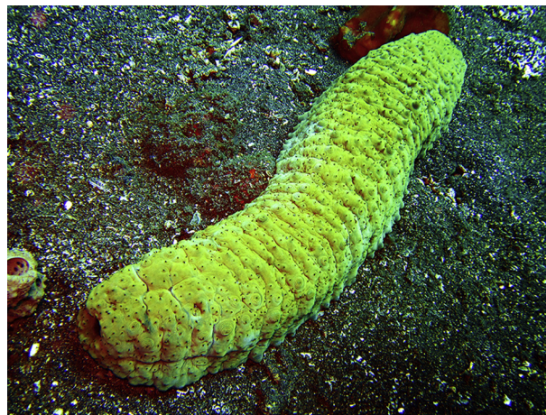
Fig. 1. Stichopus hermanni from Lembah strait, Indonesia.

As shown in Table 1, S. hermanni contains high amount of protein ( 47.00\% \pm 0.36\% ) and low percentage of lipid ( 0.80\% \pm 0.02\% ). This sea cucumber contain significant amount of sulfated glycosaminoglycan. Glycosaminoglycan are long, unbranched polysaccharides composed of repeating disaccharide units consisting of alternating uronic acids (D-glucuronic acid or L-iduronic acid) and amino sugars (D-galactosamine or D-glucosamine) Glycosaminoglycan are divided into non-sulfated and sulfated glycosaminoglycan. Sulfated glycosaminoglycan extracted from S. hermanni