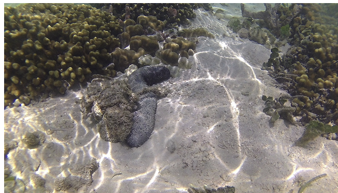
Fig. 7. Holothuria leucospilota .

Sea cucumber H. leucospilota (Fig. 7) is a tropical holothurian