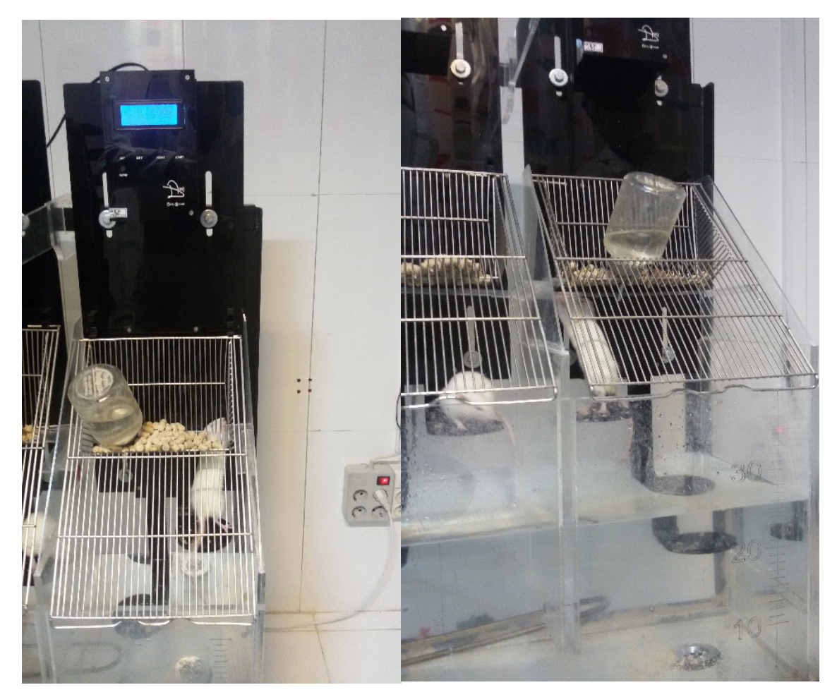
Figure 1. SD apparatus "water-box". A holding time that was considered to allow water and food intake.

Animals were placed in sleep deprivation apparatus for 48 hours on pedals while are moving.