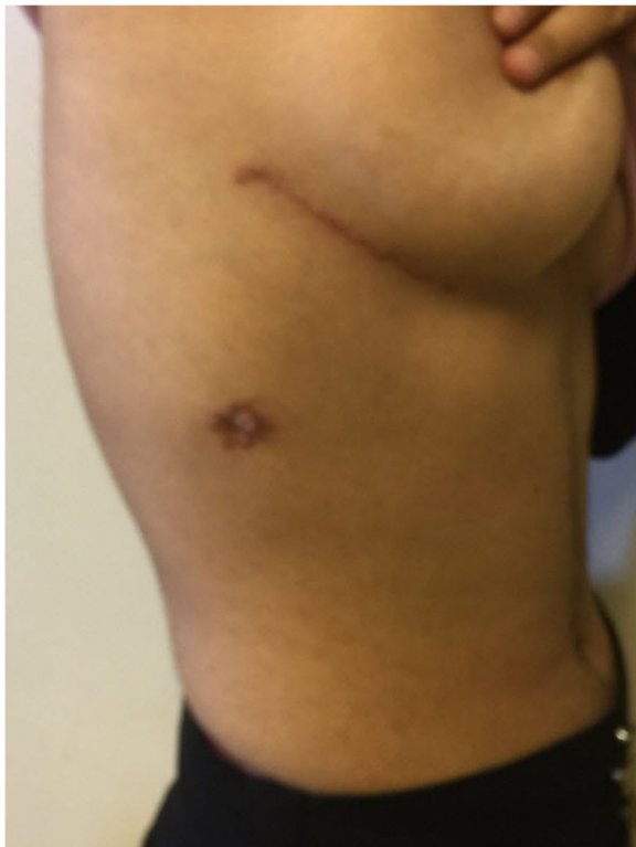
Fig. 2 Postoperative cosmetic scar