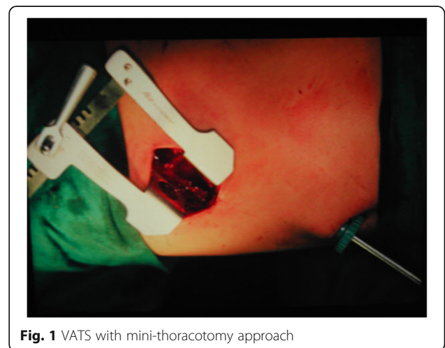
Fig. 1 VATS with mini-thoracotomy approach

In the event of bilateral hydatid cysts, surgery was performed first on the larger cysts. Preoperative chest radiography and CT scanning were performed on all patients. In patients presented with combined pulmonary and hepatic hydatid cysts, we proceeded with simultaneous combined resection of hydatid cysts in one stage through midsternotomy along with laparotomy or transdiaphragmatic removal of liver cysts in order to avoid three-stage operation of two thoracotomies and a laparotomy.