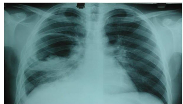
Fig. 5 Ruptured cyst