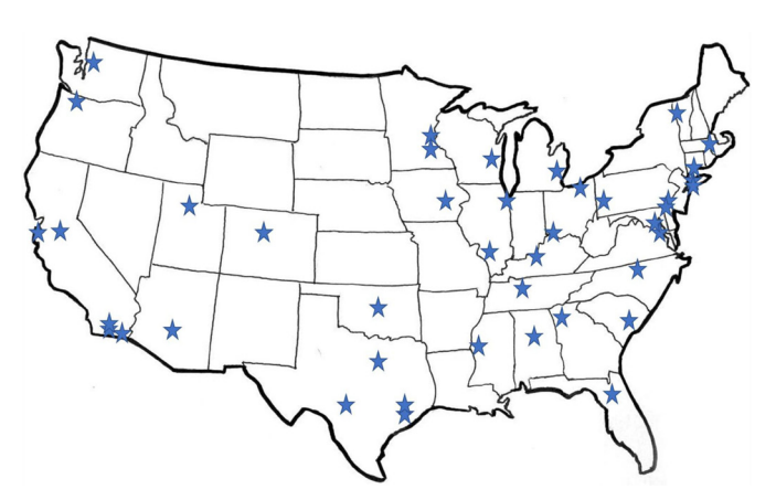
Figure 3 Pediatric Emergency Medicine Collaborative Research Committee network member sites with intent to participate in the cross-sectional cohort analysis of disparities by race, ethnicity and language proficiency in the management of low-risk febrile infants. Participation requires completion of all local and study-wide regulatory requirements.

If no institutional guideline is available, we will apply a standardised definition of low-risk (box 1). <sup>12</sup> For the purposes of inclusion in the study database, the standardised definition will use only those laboratory values that